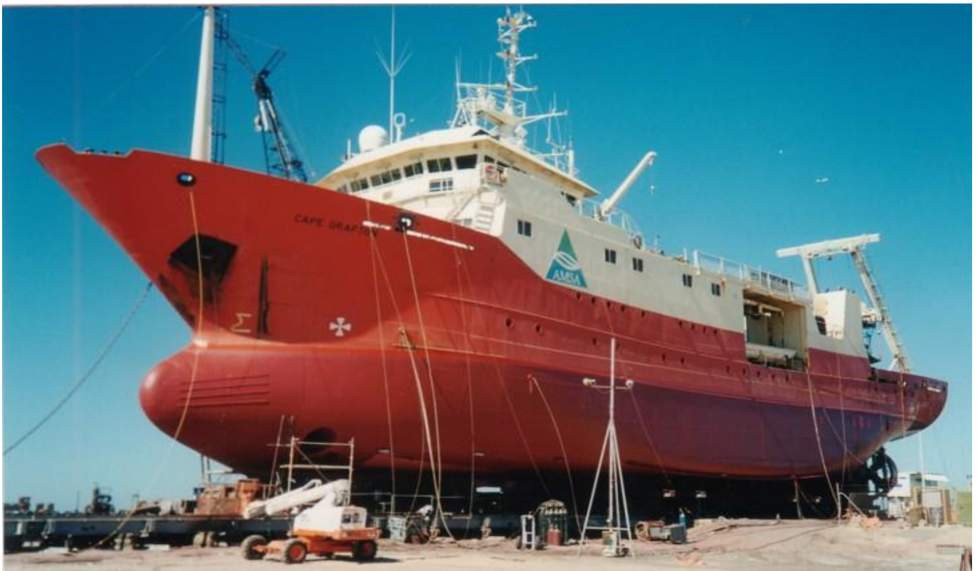
Maintenance drydocking at Tenix-Fremantle as Cape Grafton.